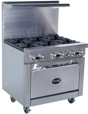
RR-6 with optional casters