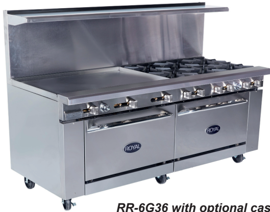
RR-6G36 with optional casters

Models: RR-12 RR-10G12 RR-8G24 RR-6G36 RR-4G48 RR-2G60 RR-G72 RR-10GT12 RR-8GT24 RR-6GT36 RR-4GT48 RR-2GT60 RR-GT72